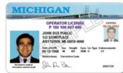
Age 21 and over—Traditional Horizontal License