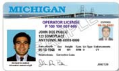
Age 21 and over—Traditional Horizontal License